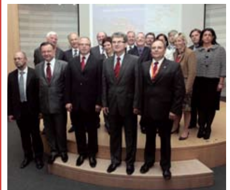
Signatories of the declaration in support of the Baltic Adriatic Corridor in October 2009 in the European Parliament